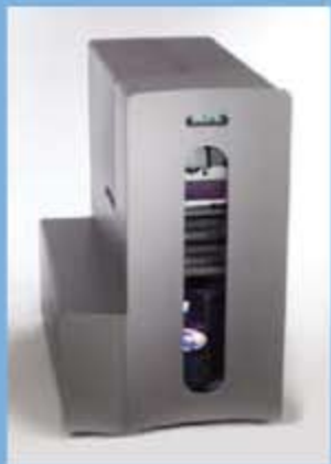
Rimage Producer III CD/DVD/BluRay autoloader